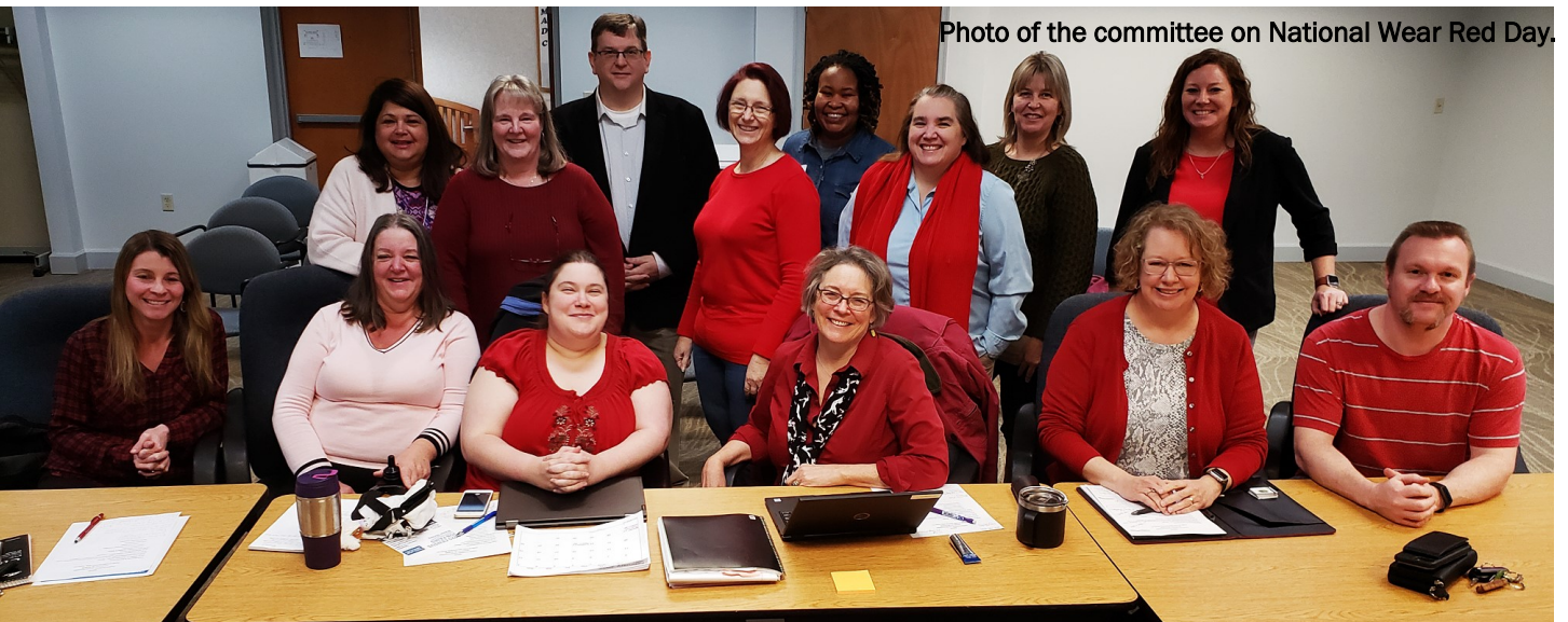
Photo of the committee on National Wear Red Day.