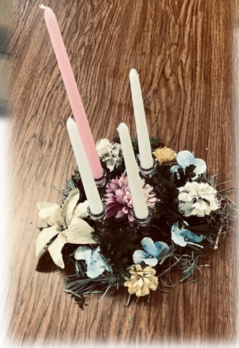
Advent Wreath designed by the elementary Sunday school class