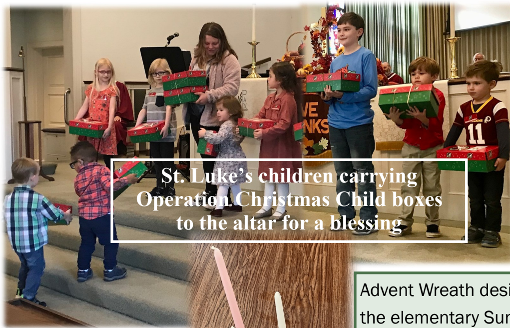
St. Luke's children carrying Operation Christmas Child boxes to the altar for a blessing

Growing in Faith from Birth through Adulthood