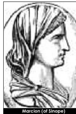
Marcion (of Sinope)

category. Their teachings were rejected because they are erroneous and yet had both a positive and negative impact on the church. Marcion, "one of the most noted and most permanently influential of the heretics of the second century," qualifies for this fourth category.